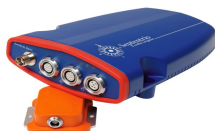
AsteRx1i / AsteRx2i HDC